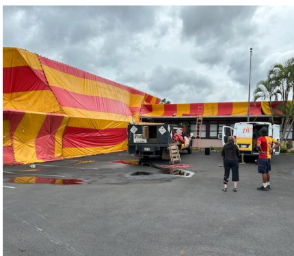
The sky was gray, but the tents were still able to go up!