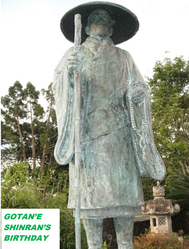
GOTAN'E SHINRAN'S BIRTHDAY